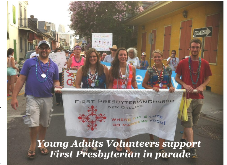
Young Adults Volunteers support First Presbyterian in parade

The 4th weekend in June was the annual NOLA pride parade, celebrating the lives and struggles of the LGBT community (Lesbian, Gay, Bi-sexual and Transgendered). This was the second year that First Presbyterian Church had a presence in the parade and this year the festivities were expanded to include a "Chevron Family Day" in Washington Square Park as well as a Block Party on Sunday afternoon on the Esplanade end of Bourbon street. First Presbyterian Church marched in the Saturday parade with help and assistance from some of the Young Adult Volunteers.